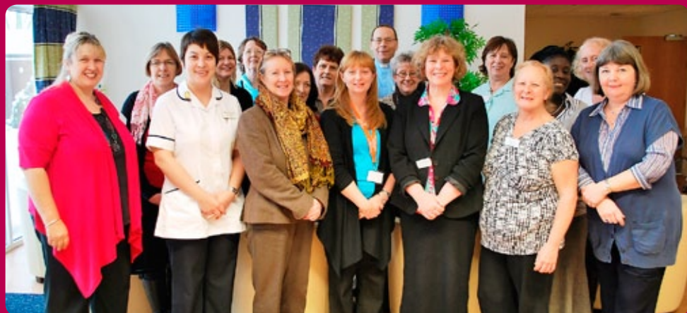
Meet some of our facilitator team.